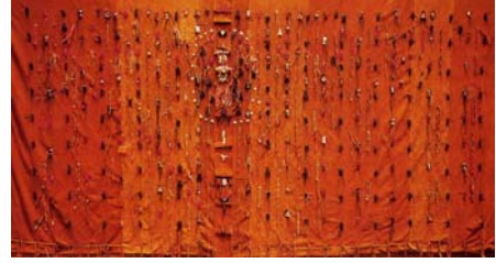
Left to right: Symphonie bleue, 2007, Le dos à l'Âme, 2008, Homage aux Chasseurs du Mandé, all images by Aboulaye Konaté, courtesy of the artist