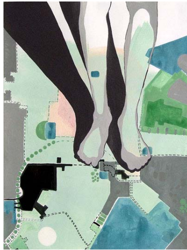
Otobong Nkanga, Delta Stories: Collapsed Projects , 2005-06, 24 x 32 cm, drawing/ink and acrylic on paper, copyright the artist

geographers and theorists lead discussions on the making of maps, considering the power plays and legacy of creative approaches to spatial thinking. For booking details visit www.iniva.org