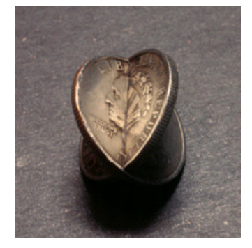
Yoan Capote, Dinero Bilingüe , 2002, Image courtesy of the artist

Cuba's complex system of economic exchange is summarised in Yoan Capote's work Dinero Bilingüe (Bilingual Money, 2002), which splices together a peso with a US quarter - rendering both coins defunct. The piece has become an iconic statement of the situation in Cuba today. In Wilfredo Prieto's Untitled (Pea), (2001) a single pea is painted as a globe. What is striking in both of these works is the minimal and almost imperceptible way they are as objects, in contrast with the significance of the meaning that they carry. Wilfredo Prieto's One Million Dollars (2002) humorously reflects a fantasy of unlimited wealth - creating an illusion that a single dollar is reproduced to infinity. An elusive grasp of currency is also key to the video Pasatiempo (Dinero) (Pastime (Money), 2005) by Diana Fonseca in which two peso coins suddenly vanish leaving a dark stain on the artist's hands - her instrument of practice. The alchemical conversion of labour into value is the subject of Iván Capote's Móvil Perpetuo (Perpetual Mobile, 2001). A vial containing the artist's sweat produced as he filed a US quarter into metal shavings sits beside photographs documenting the process.