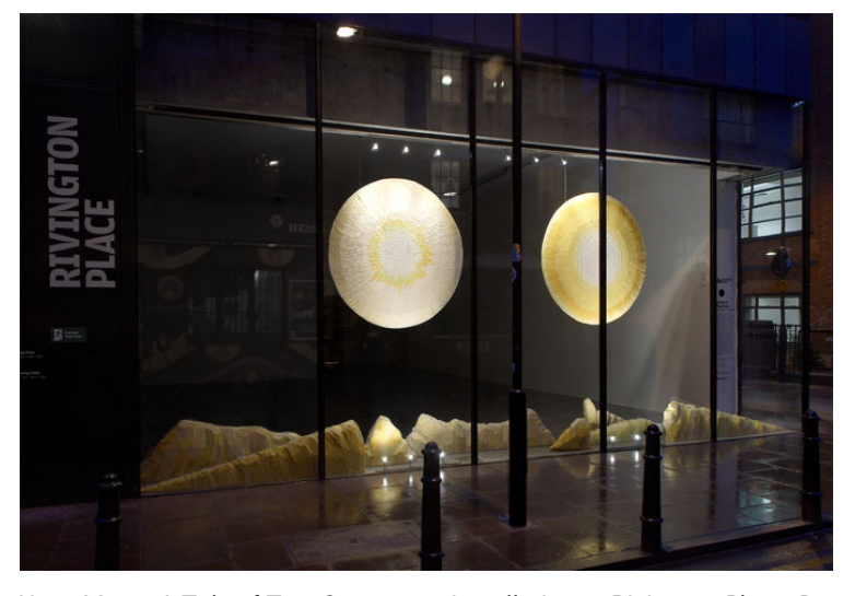
Yoca Muta, A Tale of Two Suns , 2008. Installation at Rivington Place, Dec 2008.

In A Tale of Two Suns , Yoca Muta uses folklore to explore the human encounter with rural landscape and nature. Iniva's commission will see the modern glazed façade of Rivington Place transformed into a byōbu – a Japanese folding screen traditionally featuring nature-themed sceneries and landscapes – illustrating a folktale from Sabah State in Malaysian Borneo.