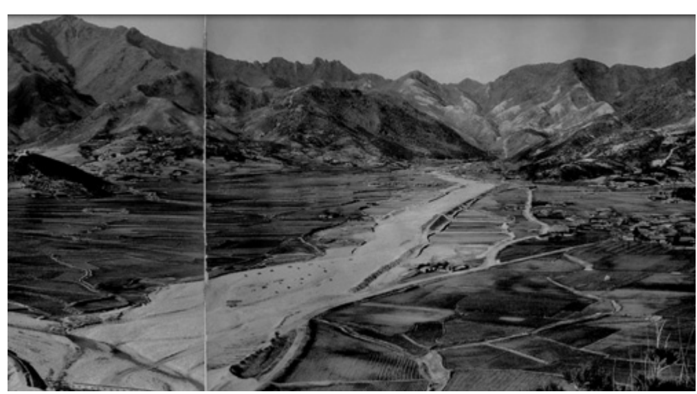
Park Chan-kyong, Sindoan, film still, 2007

By deepening his focus on the division of Korea into South and North - and the ensuing cold war politics as a dominant societal structure - Park's latest enquiry into the practice of shamanism in the so-called "post-secular" time, reconfigures a way in which art and cultural practice, especially in the nonwestern context of what he terms the "rootlessness" of its artistic genealogy, engages with political trauma and the repressed.